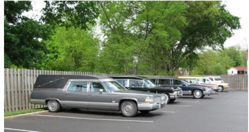
The line-up at the Volunteer Chapter meet in Owensboro, Kentucky