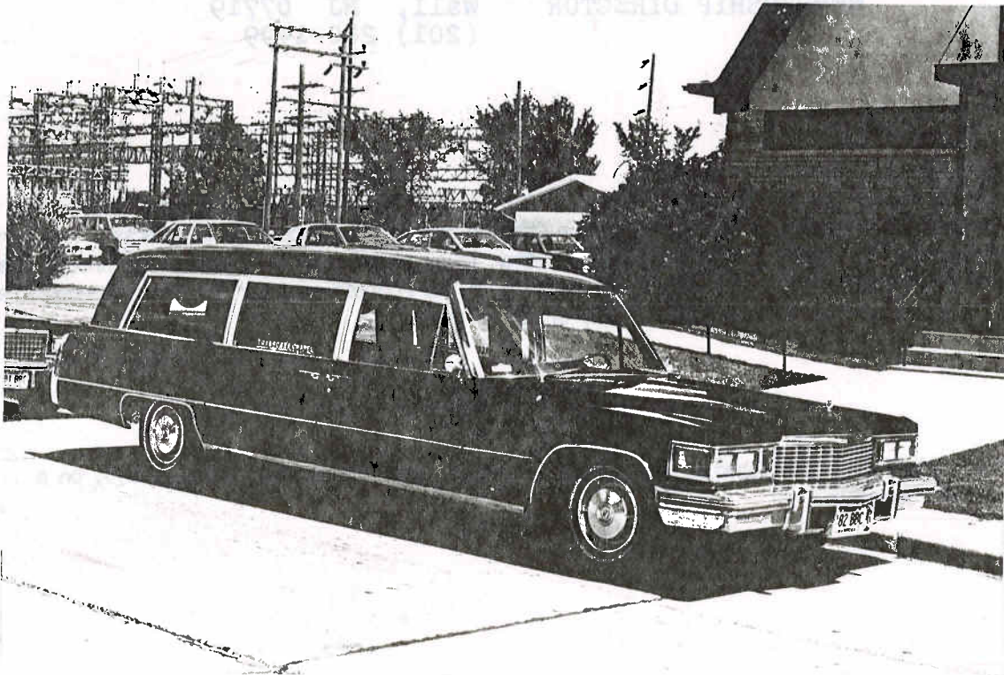
You Gotta Be Kiddin' ...take a really close look at the body work on that hearse, folks! Yep, it's a 1966 Miller-Meteor, with 1977 Cadillac sheet metal. The car is owned by Transcona Funeral Home, Transcona, Manitoba and they did the work themselves. Pretty slick, those Canadians!