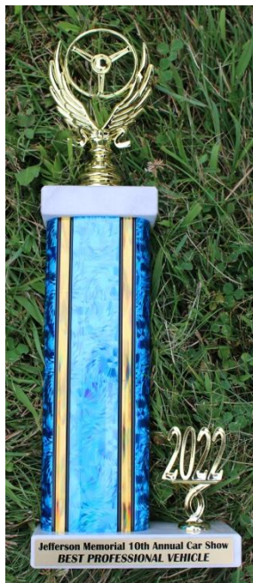
“Best Professional Vehicle”