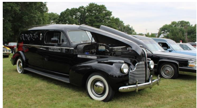
The Jefferson Cemetery owns this beauty