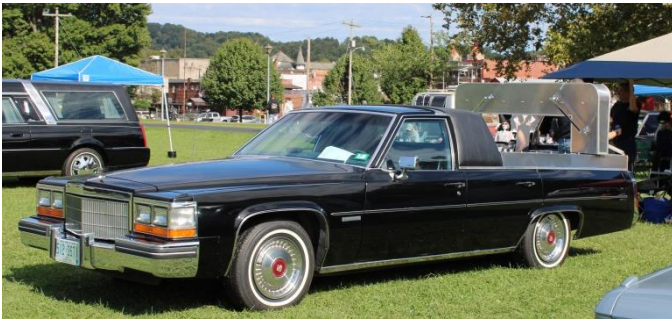
1982 Flower car from NH