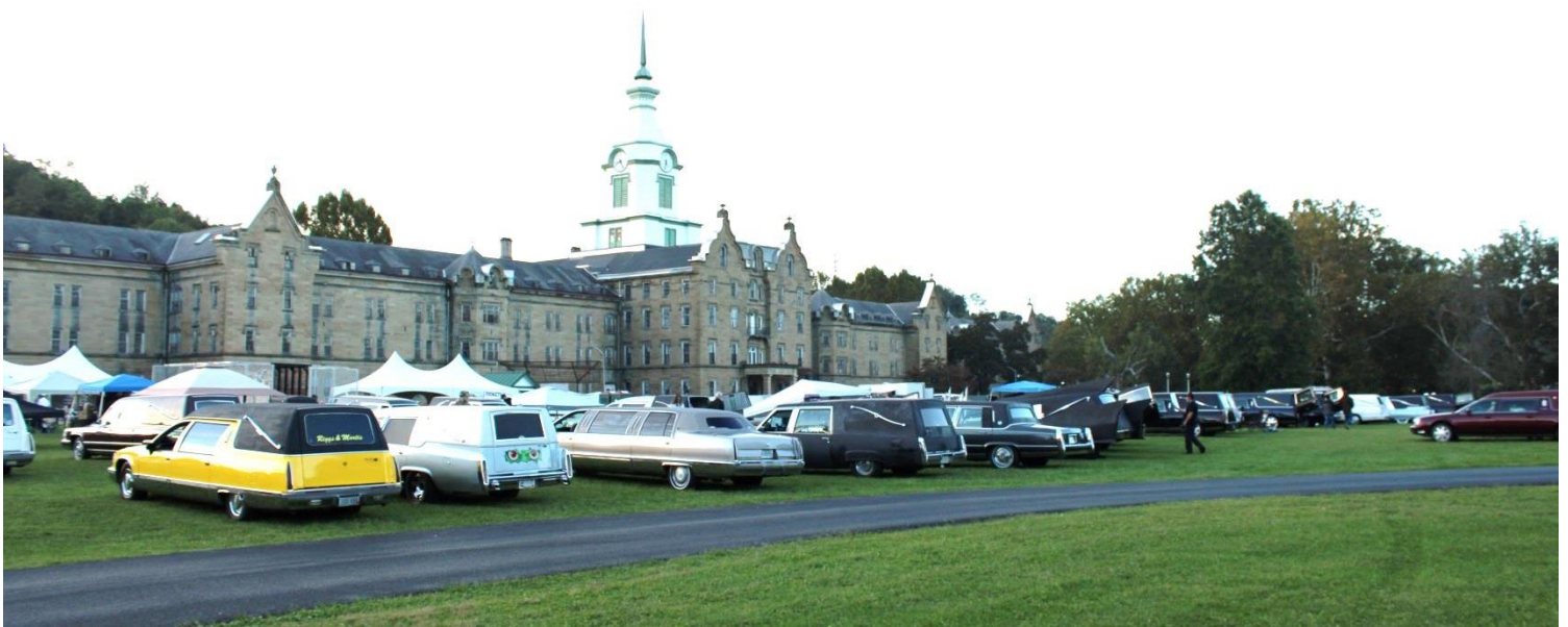
A section of the Hearsemania show field at Trans-Atlantic Lunatic Asylum

Dear Newsletter, go upon your way over mountains, plane or sea. God Bless all who speed your flight to where I wish you to be. And bless all those who rest, beneath the roof where I would bid you but bless even more the one to whom this newsletter is addressed