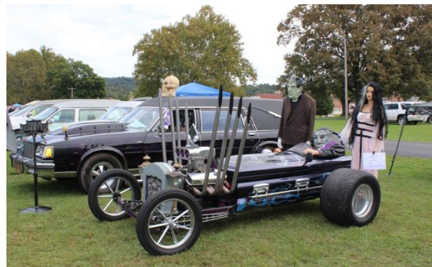
This one was 'People's Choice'