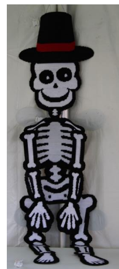
Debbie Teague made this 6 foot cross stitch skeleton