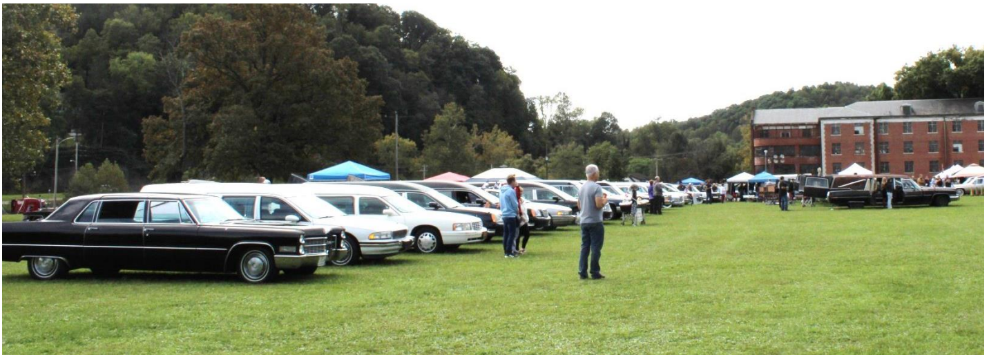
Photos of some quality cars on display at Hearsemania, Trans-Atlantic Lunatic Asylum, Weston WV

A PCS Tri-State Chapter Publication Winter Issue #1 of 2023