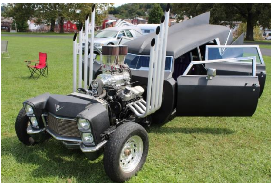
One of the other vehicles at Hearsemania