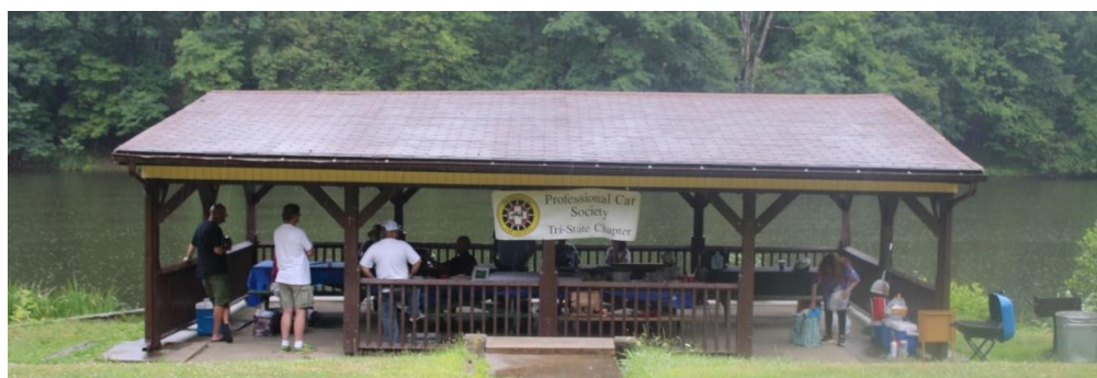
The Kolach Grove at the lakefront

Gold 1988 Eureka Chevrolet Regence Versailles