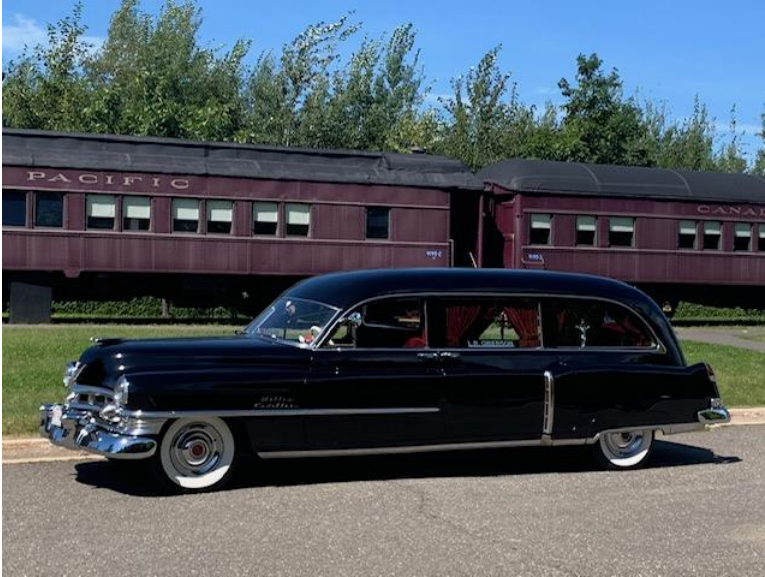
Cover on the 2023 Tri-State Chapter Calendar