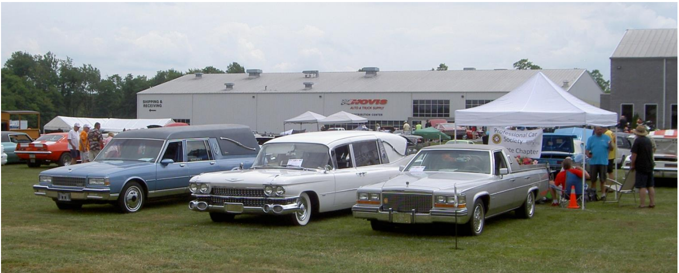
Three PCS TSC members attended the Hovis Car Cruise

This is a very nice car cruise to attend, benefits Toys for Tots