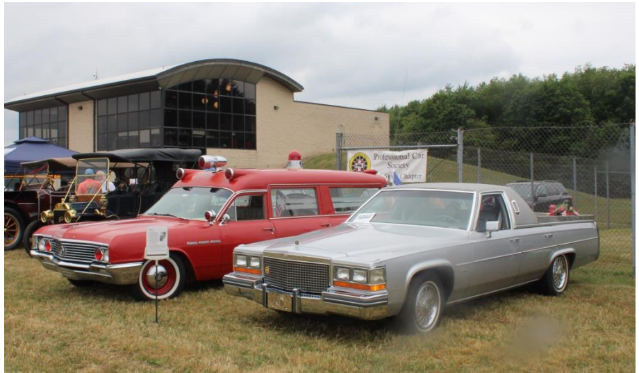
Schoenecker's 1981 Cadillac DeVille Flower car