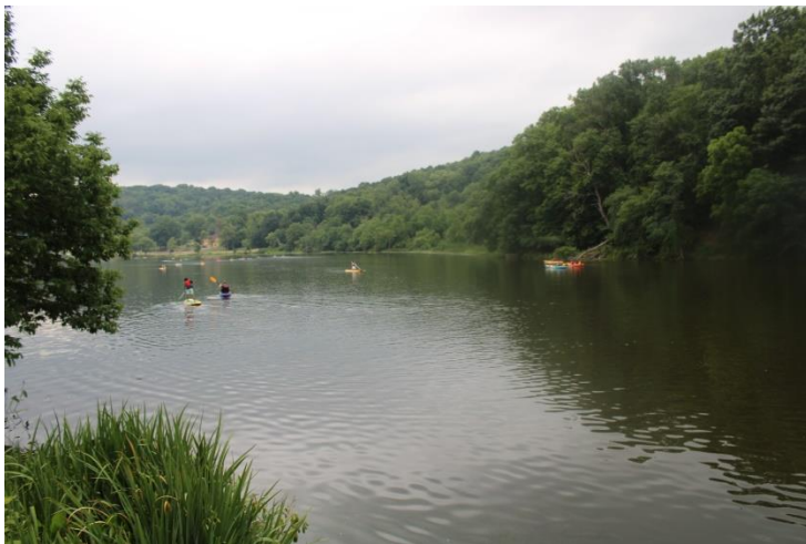
Even with the rain, there was activity on the North Park Lake.