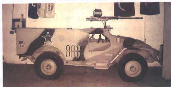
Soviet-bloc armor included this BTR-40 command car captured from Syria during the Six Day War.