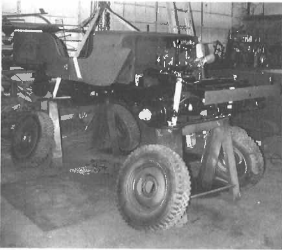
The restoration shop was re-assembling a 1946 Jeep that will be finished in U.S. Navy Shore Patrol livery.

The U.S. Army's modern capabilities were showcased by the only M1 Abrams "they'll never let into private hands" (weighing 126,000 pounds and costing $3.5 million new), a fresh-from-the-box 1996 Kawasaki special forces scout cycle showing only four original miles and a 1982 Chenworth Racing Products Delta Force dune buggy, capable of 84 mph, fitted with a lethal-looking M-60 machine gun. While it was in storage during the Indiana Chapter's visit, the museum's collection does include one interesting professional car - 1947 Cadillac limousine with a bomb-proof floor that was used by President Truman.